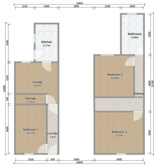
Milner Road Ground First Floor